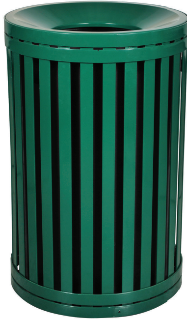
SCTP-40 ND HGR