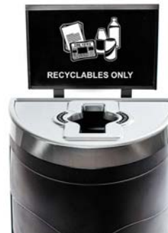
SIGN FRAME KIT