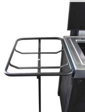
LUNCH TRAY KIT