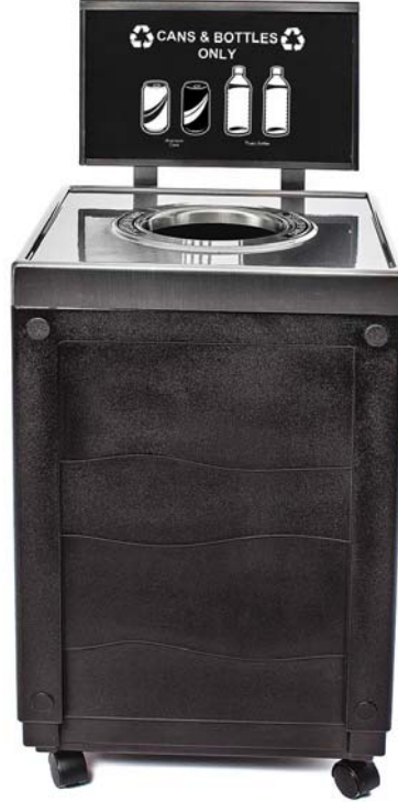
*Shown with the Optional Wheel Caster Kit and Sign Frame Kit