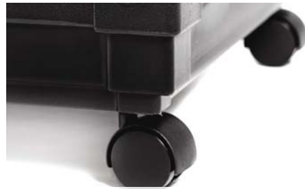
WHEEL CASTER KIT