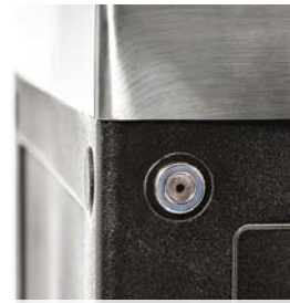
MAGNETIC CONNECTION KIT