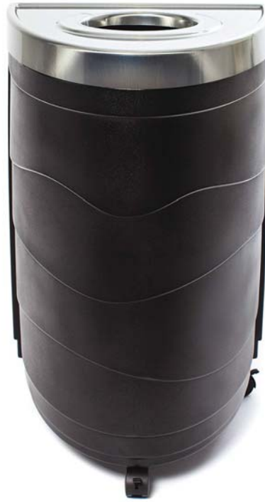
*Shown with the Optional Wheel Caster Kit