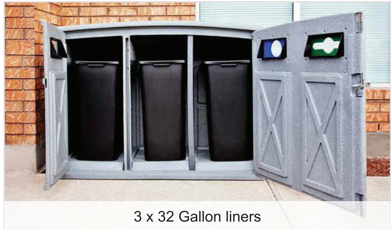
3 x 32 Gallon liners