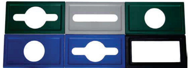
Variety of lid openings & stamping options