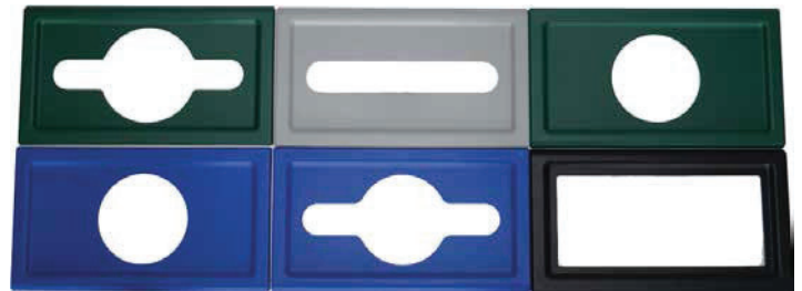
Variety of lid openings & stamping options