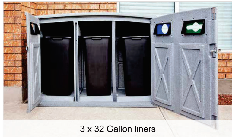
3 x 32 Gallon liners