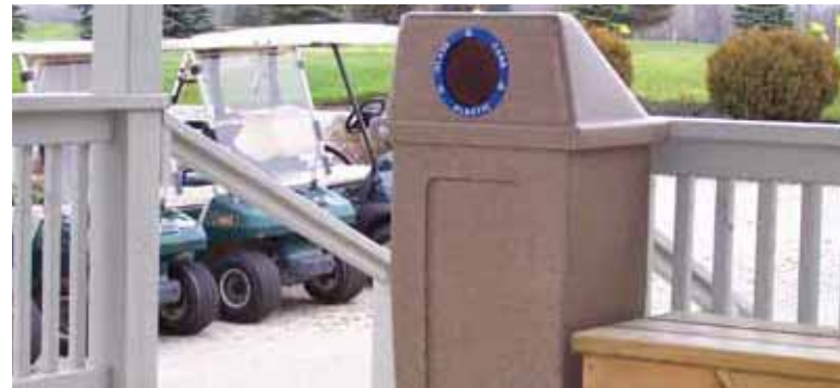
Attractive color options ensure that this bin will fit into any landscape setting