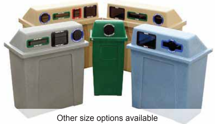
Other size options available