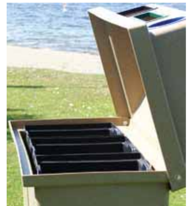
Easy to open, hinged lid