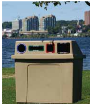
Fits into any setting