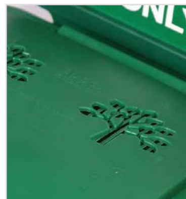
Vents Allow Compost to Breathe