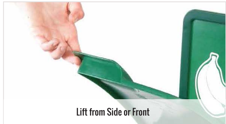
Lift from Side or Front