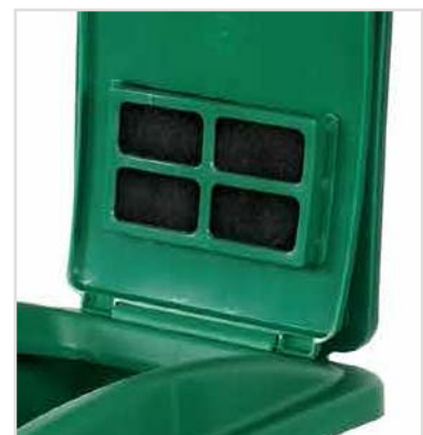
Activated Charcoal Filter Eliminates Odors