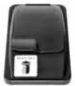
Lift Lid - Solid