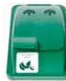
Lift Lid - Vented