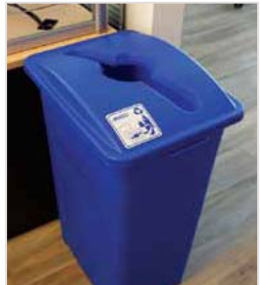
Multiple lids available