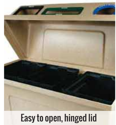
Easy to open, hinged lid