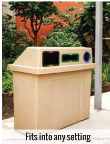
Fits into any setting