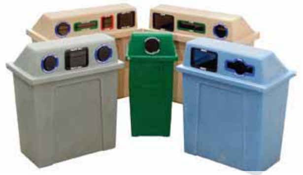
Other size options available