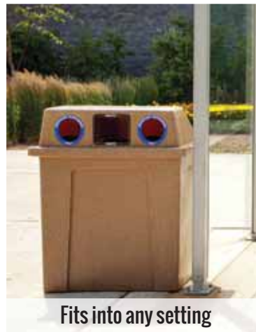
Fits into any setting