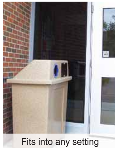
Fits into any setting