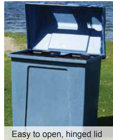
Easy to open, hinged lid