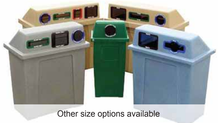
Other size options available